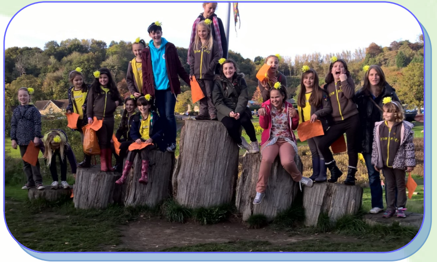
3rd Merstham Brownies made Scarecrows as part of a Reuse/Recycle activity and a local farm kindly displayed them in their field.