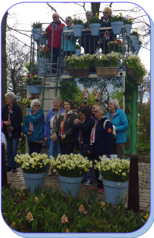
Table Tennis and T'ai chi continues to be very popular. The Voyage Award launched in 2014 for Trefoil Guild members has proved very popular. 7 members have achieved the Bronze level, 4 members have started the Silver level and another 4 members have started the Bronze level.

This year we visited the Dutch bulb fields. A visit to Highgrove, the country house and gardens of HRH The Prince of Wales and Duchess of Cornwall was also a highlight. On St George's Day we rambled across Wimbledon Common and visited the Windmill where Baden-Powell wrote some of 'Scouting for Boys'. We finished our year with a trip to the John Rutter Carol Concert at the Albert Hall.