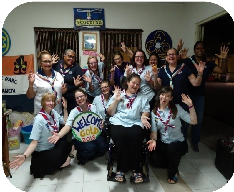
[Photo: Meeting the Board of the APG]

In September 2017 we began our GOLD journey by taking part in a challenging selection weekend in Belfast. We were both lucky enough to be selected to be part of the GOLD Aruba 2018 project, which included 6 months of planning, training weekends and Skype calls preparing for the 3-week project in Aruba. It was the third year of the project in Aruba, building on the work done by previous teams working with the Arubaanse Padvindsters Gilde (APG). Aruba, for those that don't know where it is, (and we didn't!) is a small island with a population of 110,000 in the Caribbean, just 15 miles from the coast of Venezuela. The aim of the project in 2018 was to focus on youth participation and leadership, which we did by running training sessions with both girls and leaders, helping to develop the organisation and maintain their new WAGGS membership.