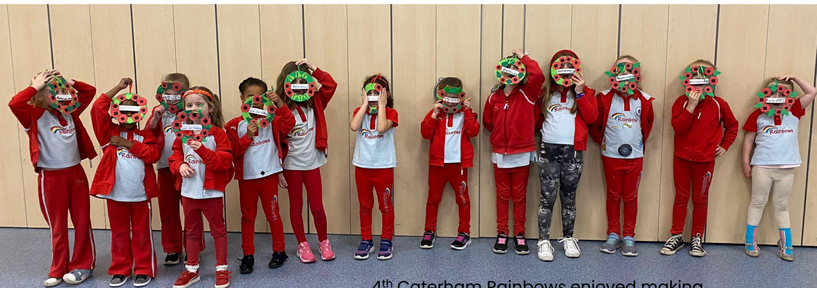
4 th Caterham Rainbows enjoyed making wreaths and learning about Secret Agent Olive.