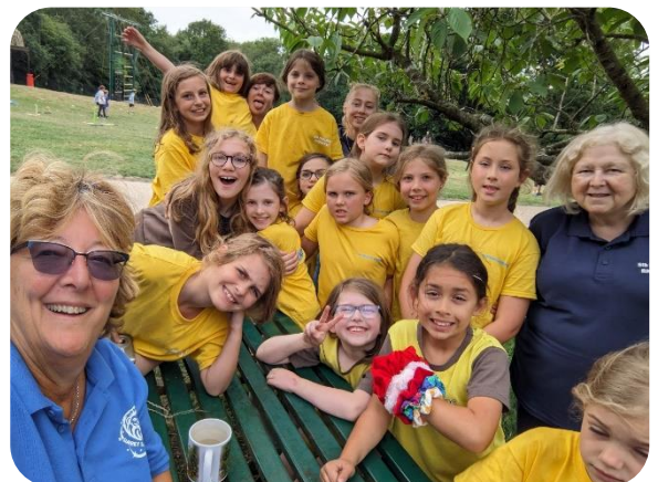
5 th Reigate Brownies

'Although not everyone is smiling, there is a lovely sense of positivity in this image and it really shows how close the girls and leaders are.'