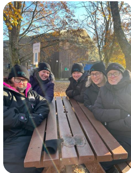
The Guides made orange cakes and toffee apples as well as playing in the 'snow'.