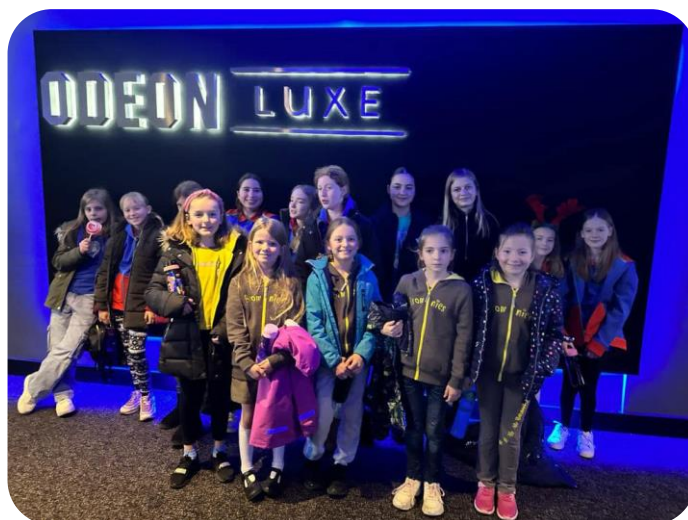
1st Fetcham Guides and Brownies enjoyed watching Wish at Epsom Odeon.