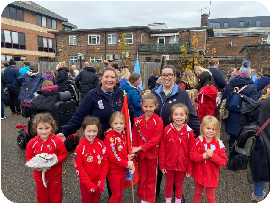
6 th Horley Rainbows at their Remembrance Parade