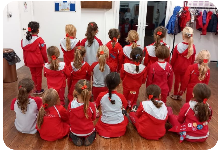
Rainbows from Oxted, Lingfield and South Godstone and the Brownies from South Godstone have all made poppies for their hair to wear for Remembrance.