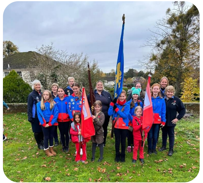
Guides, Brownies and Rainbows from Fetcham took part in the Remembrance service.