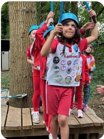
2 nd Fetcham Rainbows