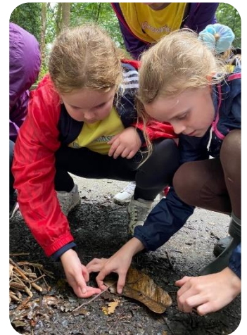
4 th Caterham Brownies

'Guiding isn't just about having a great time; it is also about having a safe place to challenge yourself. The two photos that I selected as the winners of the county photography competition sum that up perfectly. They show concentration and determination to learn and progress, whilst having fun and working together!'