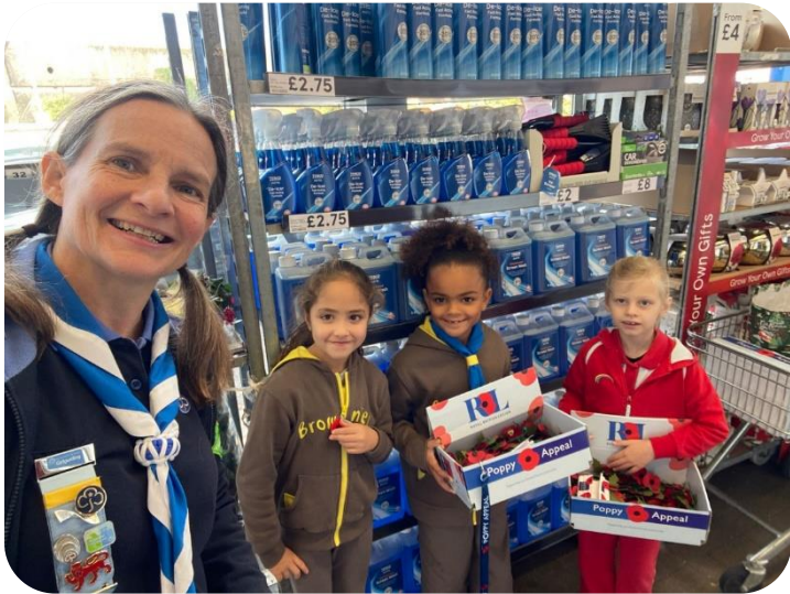
4 th Caterham Rainbows and Brownies helped raise money for the Royal British Legion.