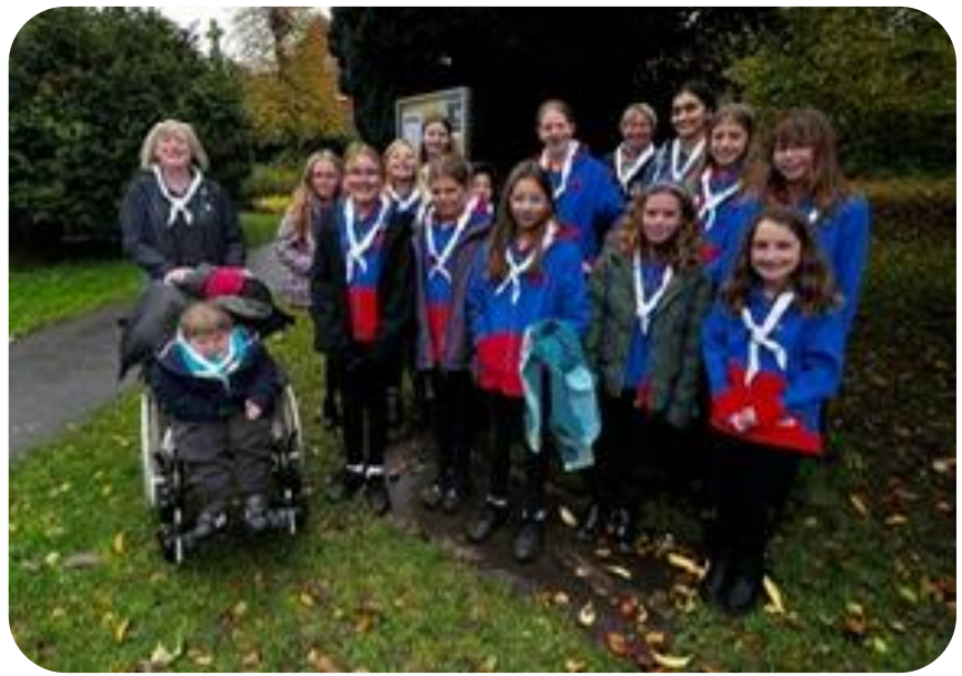
5 th Dorking Guides made a beautiful wreath and paid their respects at the Remembrance Parade