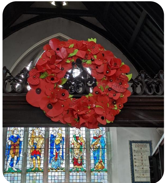
1 st Ewell Village (St Mary's) Brownies and Guides represented Epsom Division at Remembrance. The Guides made the wreath in church and read the prayers.