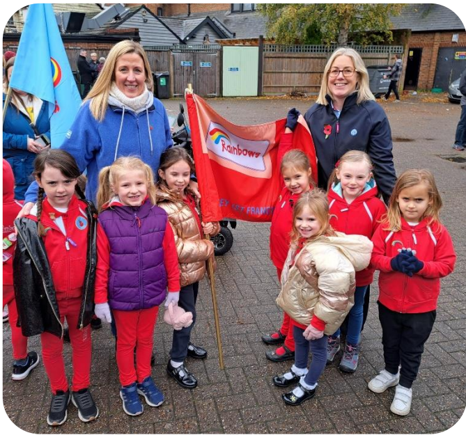
7 th Horley Rainbows