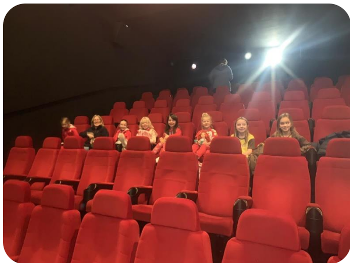
7 th Horley Rainbows