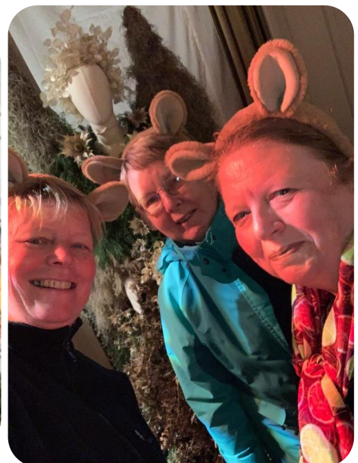
Even leaders can dress up. The three bears at Polesdon Lacey.