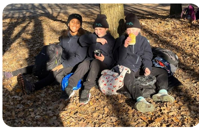
Photos from 1 st Fetcham Guides and 1 st Chaldon Guides