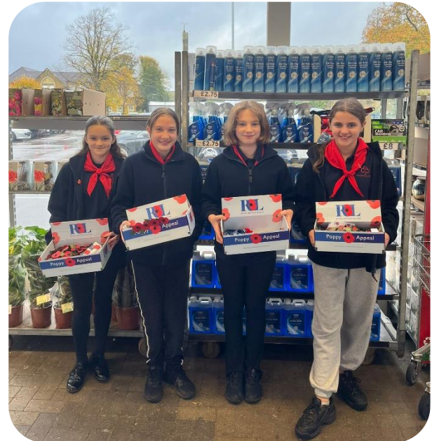
1 st Chaldon Guides braved a cold and wet morning to sell poppies in a local supermarket.