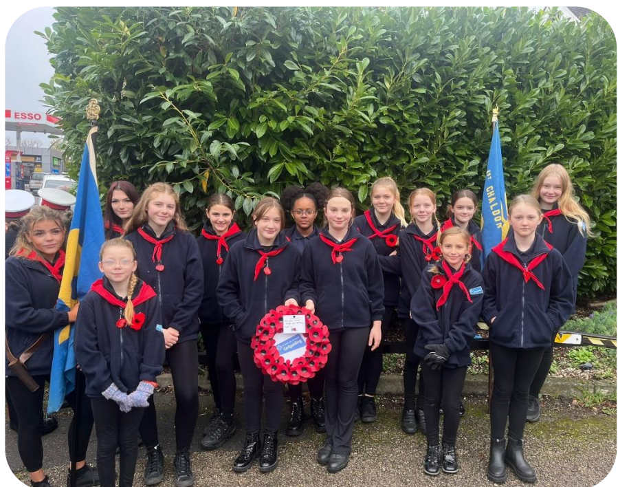
1 st Chaldon Guides ready for the Remembrance Parade