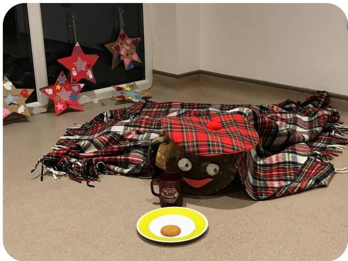
Caga Tio from Catalonia

I was invited to help at a sleepover for 2 nd and 12 th Dorking Brownies. The sleepover was held at Faurefold and the theme was 'Christmas around the world'. The Brownies started by making lovely star lanterns, called Parol decorations, from the Philippines. They then had a BBQ on the beach in Australia before visiting Sweden to make angel chimes, Italy to make a nativity scene in the snow, Norway to make a gnome and Germany to make an origami Christmas tree. Before going to bed, they were introduced to Caga Tio from Catalonia. He is a log that 'poops' gifts!