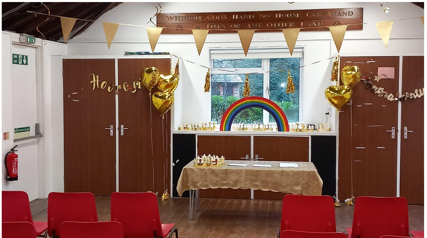
Oxted Guide Hall all set up for the gold award presentations.

https://www.facebook.com/girlguidingsurreyeast https://www.instagram.com/girlguidingsurreyeast