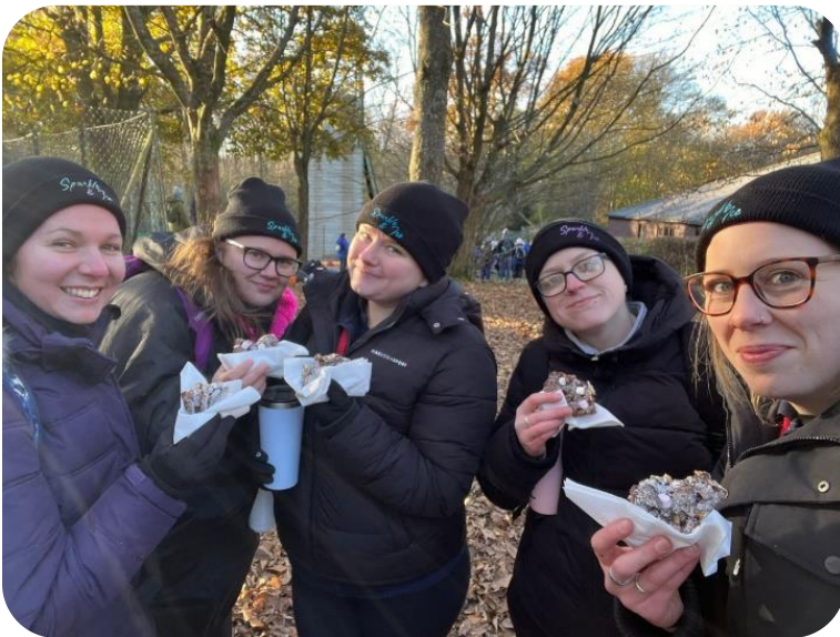
Leaders found cake!

Sparkle and Ice was a winter camp held at Foxlease in November for guides and rangers. Some units in Surrey East have shared their experiences of attending this event.