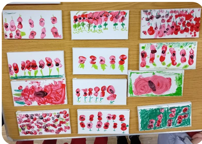
3 rd Merstham Rainbows