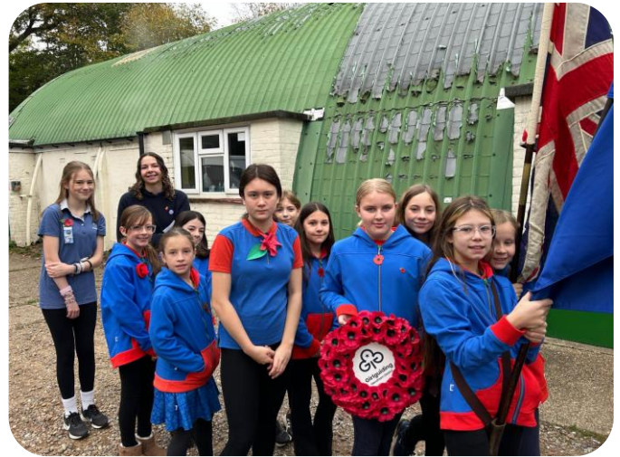
6 th Merstham Guides at All Saints remembrance parade