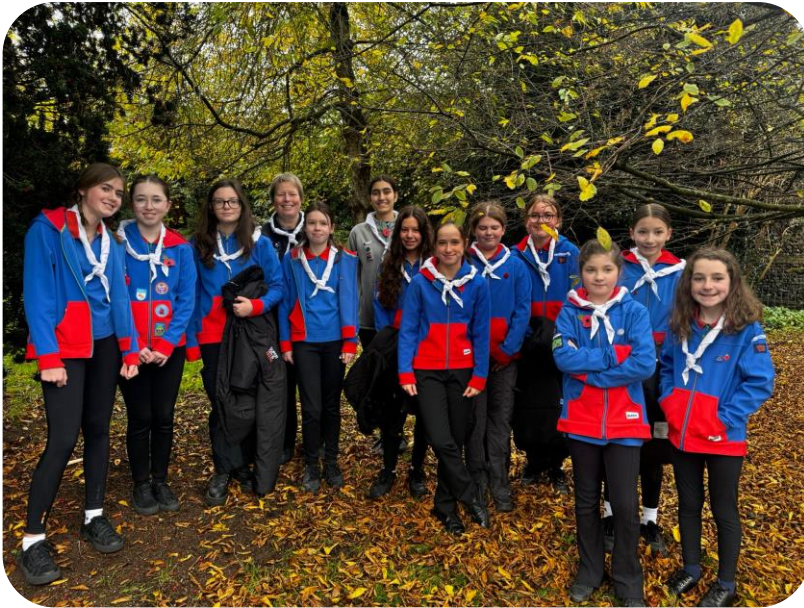
5 th Dorking Guides ready for the parade