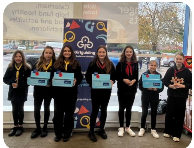
Chaldon and Caterham Guides raising money for The Poppy Appeal