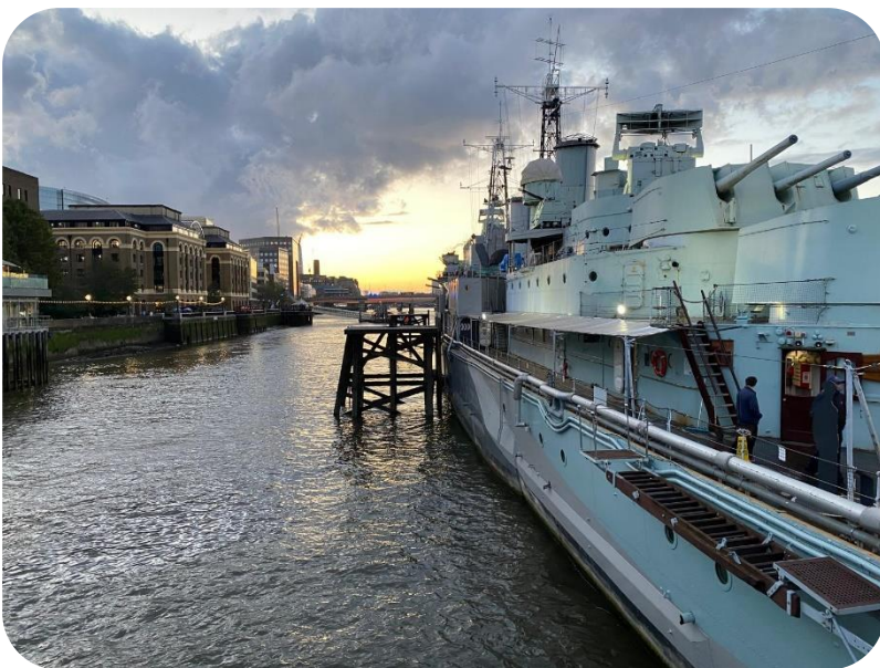
Sunset on the ship

On returning to HMS Belfast we met up again with the lovely Nyree who, having explained the overall plan for our 'sleepover proper', left us to make our bunk beds and settle in. Nyree then escorted us up to the Stoker Café, where we enjoyed our evening meal of fish and chips, or sausage and mash, which was served up in original metal mess tins – quite an unusual, and absolutely delicious, dining experience!