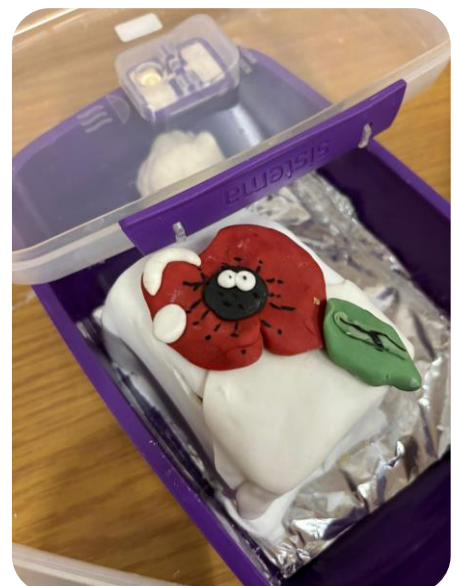
Lingfield Guides decorated cakes for remembrance.