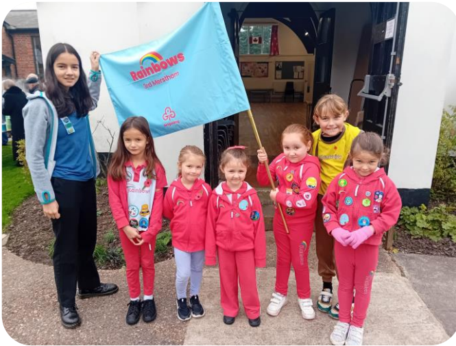
3 rd Merstham Rainbows took part in our community act of remembrance