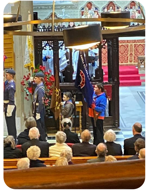
Brownie and Guide flag bearers at St Marys Church Ewell Village representing Epsom Division