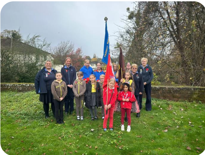
Rainbows, Brownies and Guides from Fetcham after their remembrance service