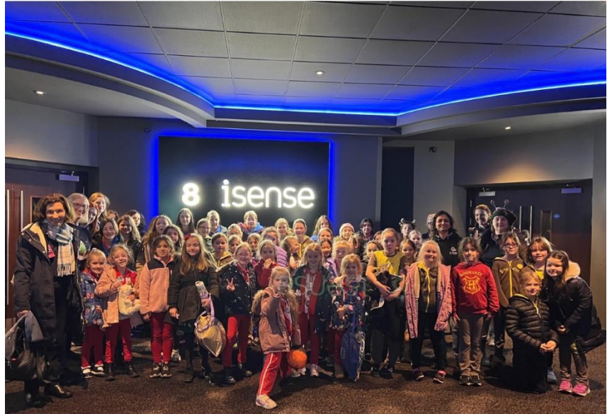
1 st Ashtead Brownies