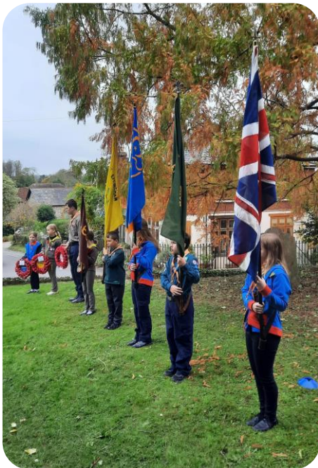
Effingham Guides and Brownies joined Scouts and Cubs at St Lawrence Church in Effingham for the remembrance parade and service to honour those that gave their lives for our peace