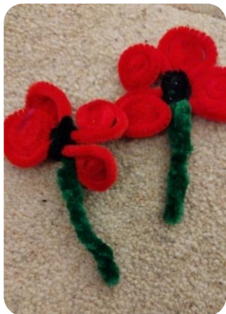
7 th Bookham Brownies made poppies out of pipe cleaners