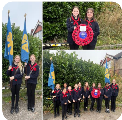
1 st Chaldon Guides ready for their remembrance parade