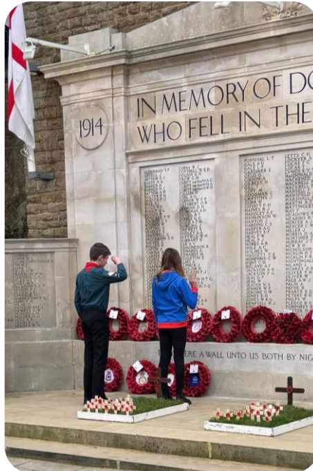
Wreath laying, 5 th Dorking Guides