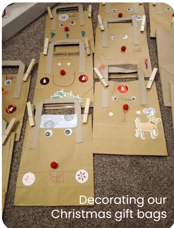
Decorating our Christmas gift bags