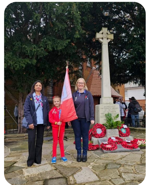
1 st and 3 rd Ashted Rainbows