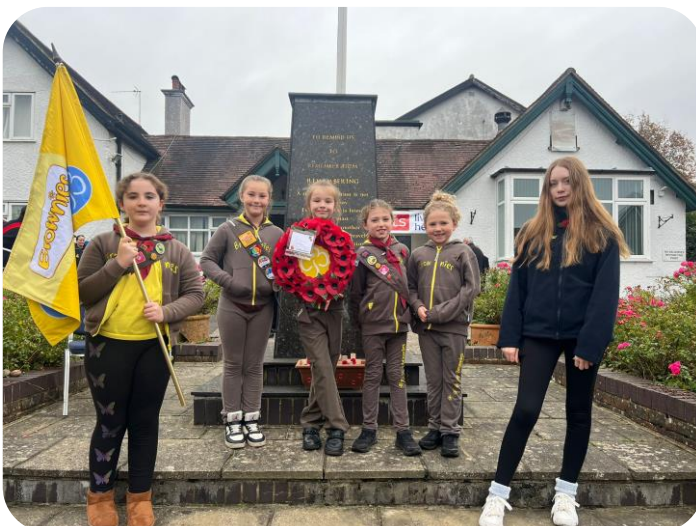
9 th Caterham Brownies. My young leader did a superb job while I was at another church watching my son in the Air Cadets