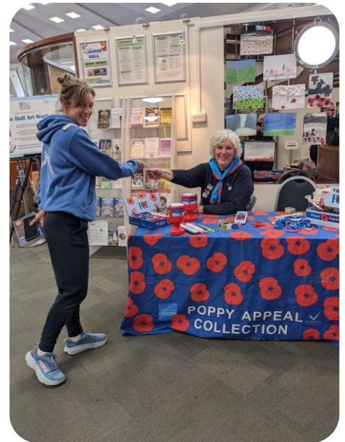
1 st Ewell Village (St Mary's) leaders helped to sell poppies for The Royal British Legion Poppy Appeal in Bourne Hall, Ewell.