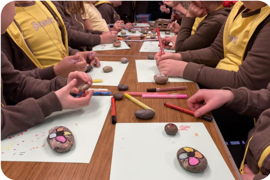
9 th Caterham Brownies decorated pebbles for Remembrance Sunday. It was a relaxing evening after a busy day at work for the leaders, and everyone left with a smile on their face.