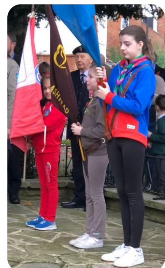
Representing Ashted District at the remembrance parade